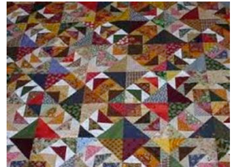
Bring & Brag/ Just Finish It - July Meeting